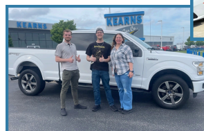
Proud owners with their new vehicle from Kearns Auto