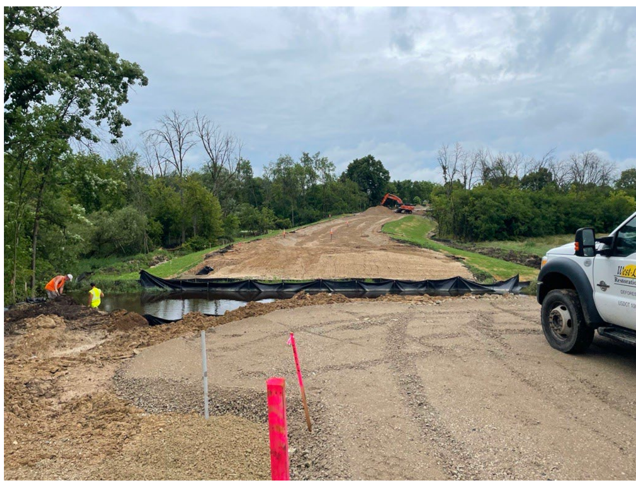
Base course on the north end of the project.