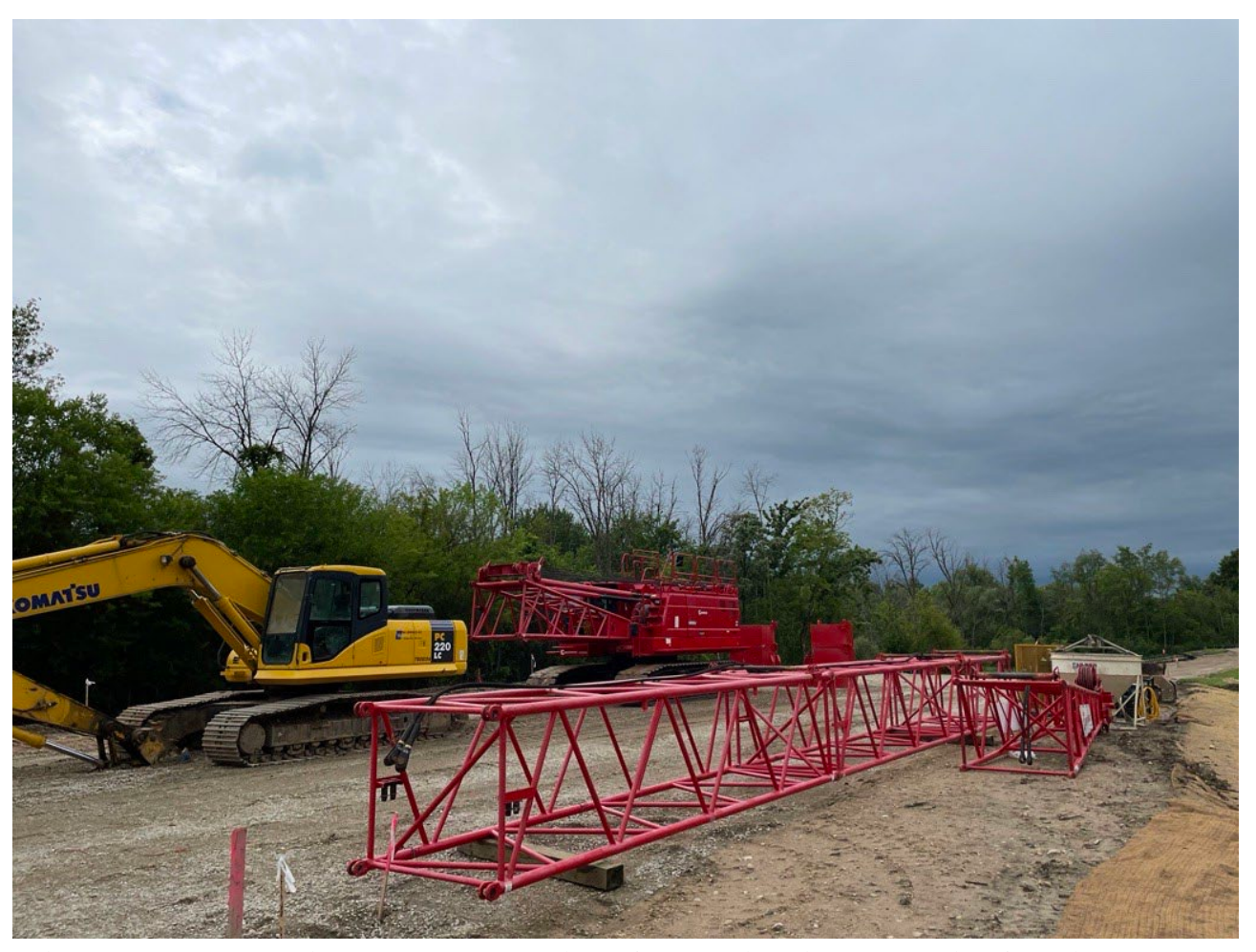
Disassembled crane in place on south side of the project in preparation for bridge construction.