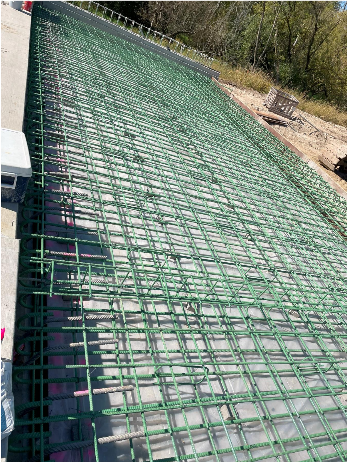
Approach slab steel reinforcement.