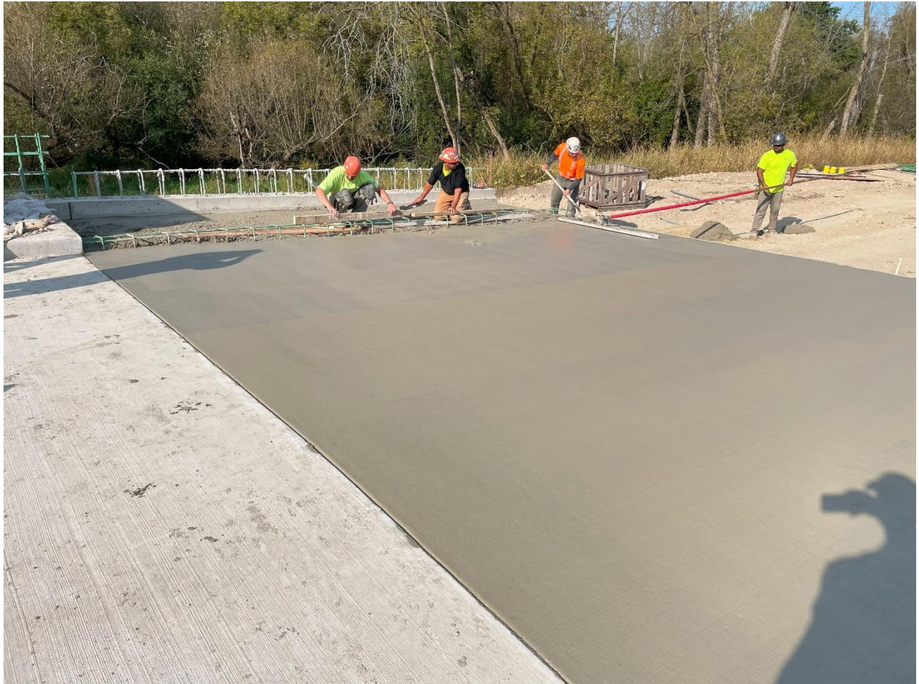
Approach slab after concrete pour.