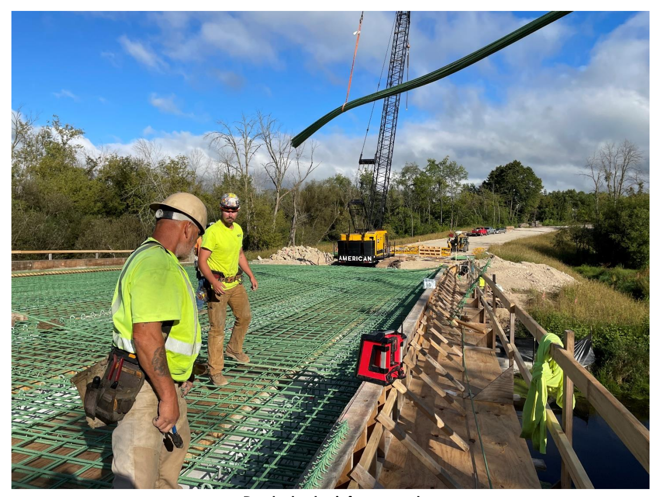
Deck steel reinforcement.