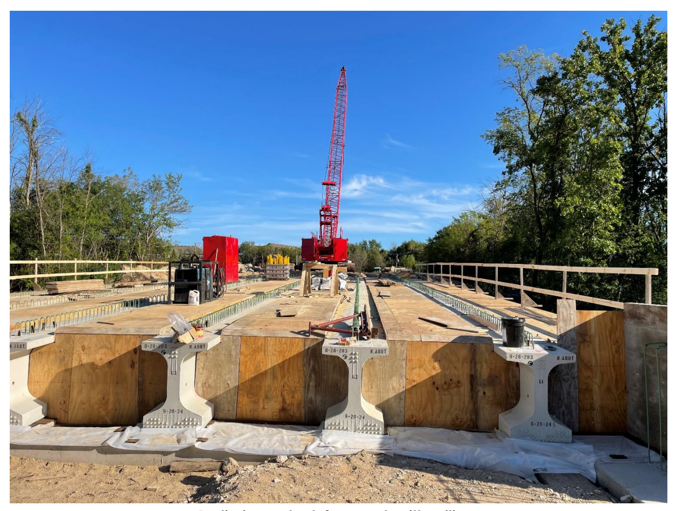
Preliminary deck formwork with railings.