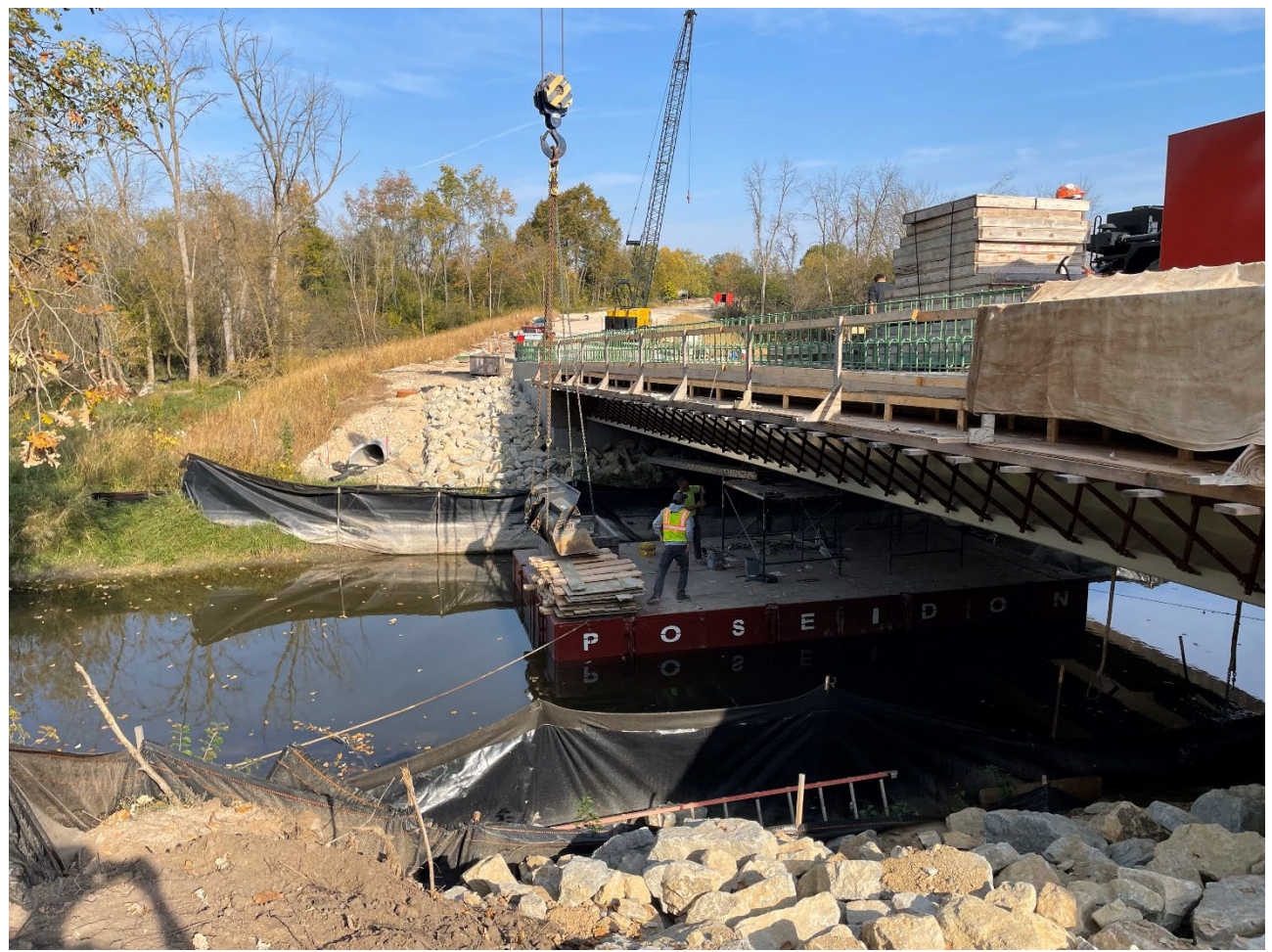
Stripping underside formwork on barge.